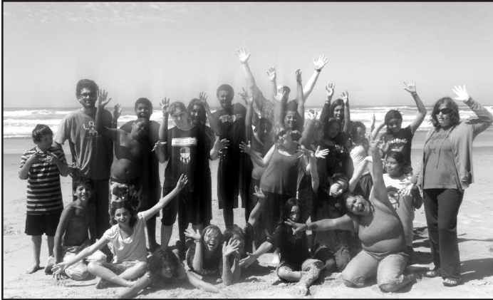
NAYA Youth at Rockaway Beach