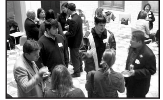
Native Professionals Night at Portland's City Hall in April

With over 38,000 Native Americans, the Portland Metro Area makes up the 2nd largest Native Professional population in the country. In 2007, NAYA Family Center started organizing quarterly events called Native Professionals Night (NPN) to bring together Native professionals in Portland to network and socialize in order to build the strength and voice of Portland's Native community.