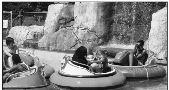
NAYA 2008 Summer Institute having fun at Bullwinkle's Fun and Family Center

Congratulations to all of the youth and staff that were involved in NAYA's Summer Institute for their accomplishments, hard work and successes!