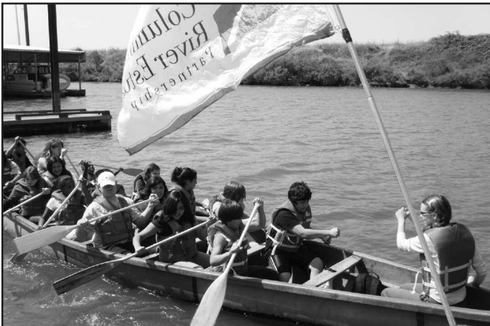
MASAP Summer Camp canoeing on the Lower Columbia River Estuary