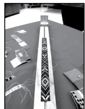
Dyami's beaded belt on the loom