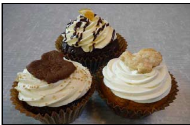
Just a few samples of what Cupcake Jones has to offer

NAYA Family Center proudly recognizes Cupcake Jones as a successful representative of Native-owned businesses in the Portland area! For more information on their great service and wonderful treats, contact them at 503-222-4404 or see their website at www.cupcakejones.net .