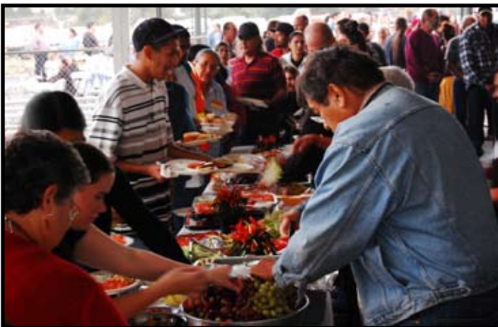
Dinner Time at the Fall Gathering