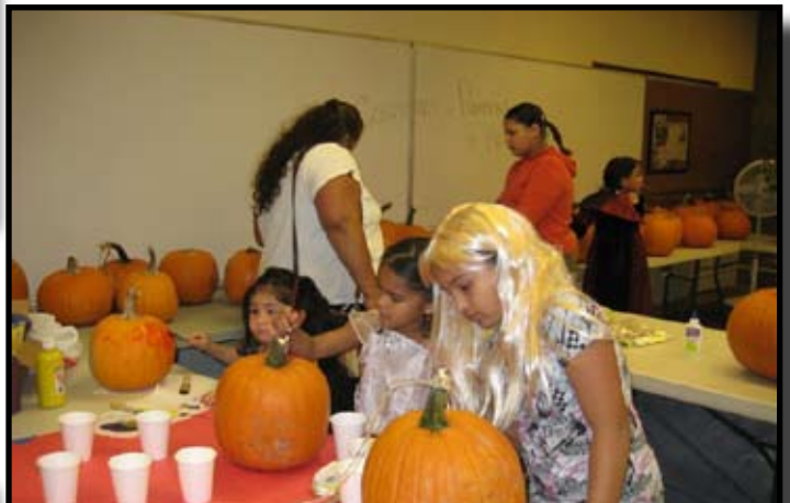
Pumpkin decorating at Halloween Family Night