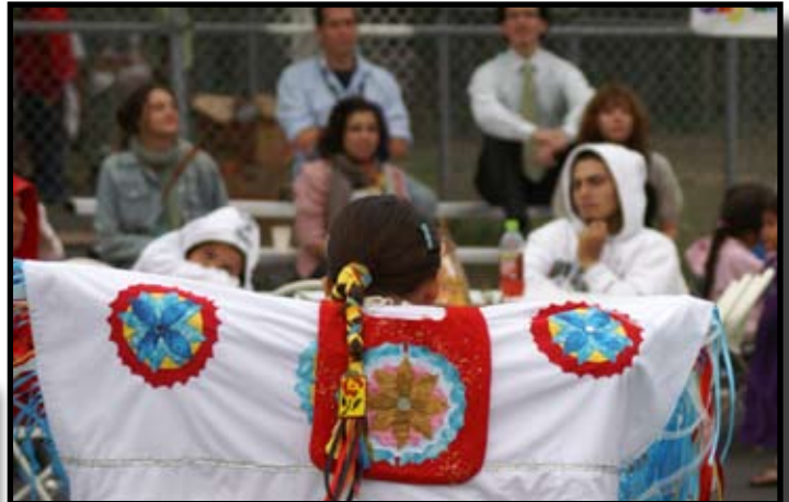
NAYA Dancers at the Fall Gathering