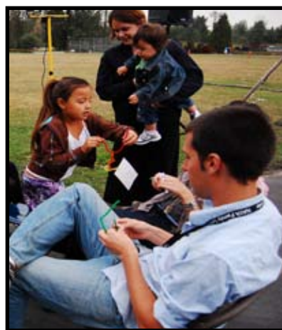
Volunteers keep the children entertained at Fall Gathering

The Human Rights Commission was created on March 19th, 2008 and held its first meeting on November 5th, 2008. The Commission will use the principles of the UN Declaration of Human Rights in order to "eliminate discrimination and bigotry, to strengthen intergroup relationships and to foster greater understanding, inclusion and justice for those who live, work, study, worship, travel and play in the City of Portland."