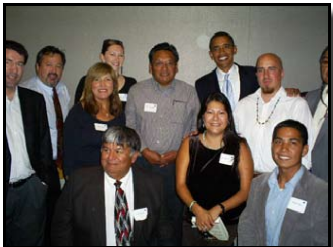
President Elect Barack Obama meets with Portland area Native leaders

"American Indians are the only ethnicity that the U.S. Census Bureau doesn't track when it comes to election data."