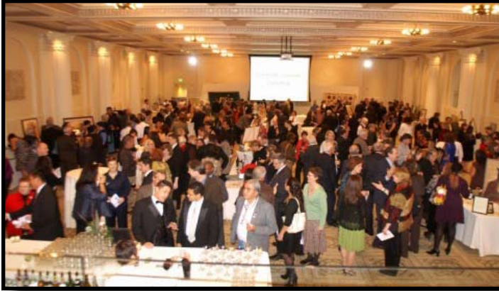
Guests at NAYA Auction