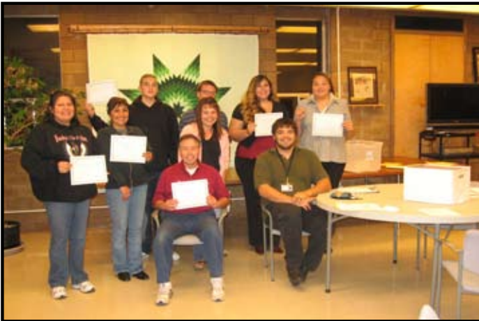
The first seven graduates of the Financial Wellness Class Series