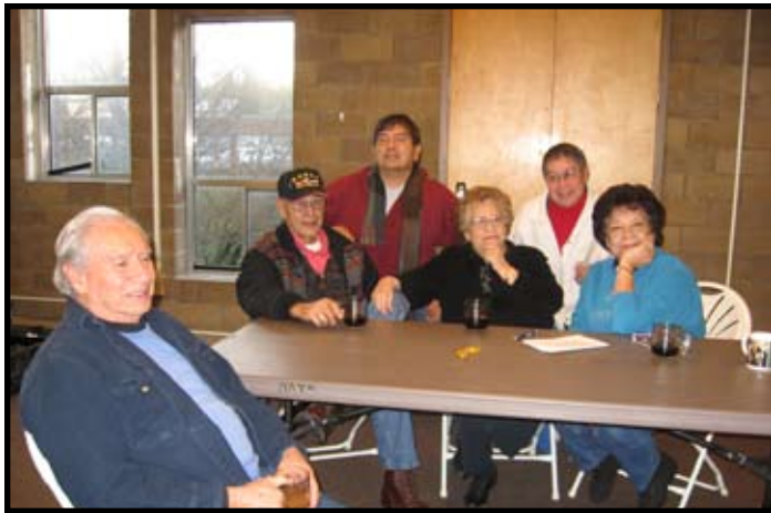
Room 208, currently being remodeled to become the Elder's Room