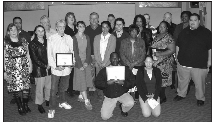
Graduations of employment program with Mayor Tom Potter

BHCD and Mayor Potter recognized NAYA Family Center's program along with other programs funded by the Economic Opportunity Initiative including Central City Concern, Oregon Tradeswomen and SE Works.