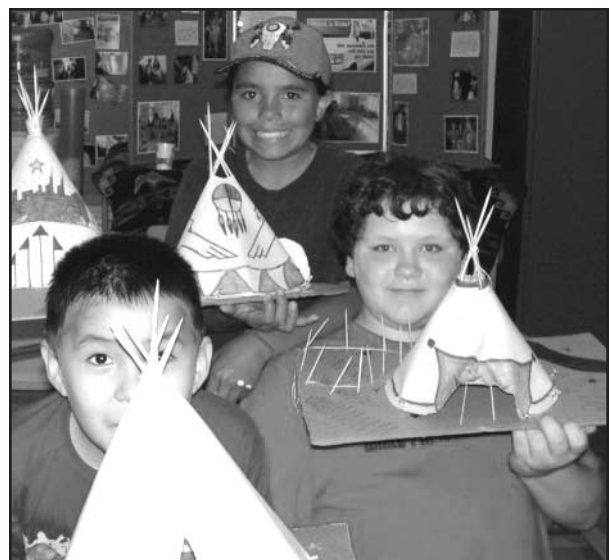
NAYA kids show off the tipis they made in Culture Class